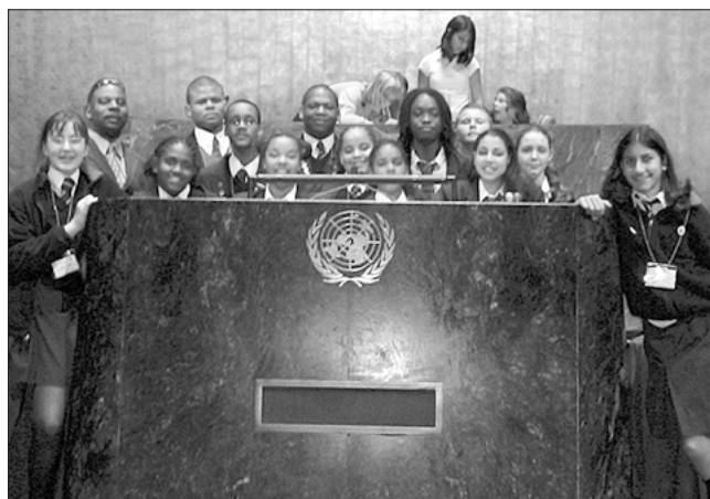
The Berkeley Institute, CedarBridge Academy, BHS and Sandys Middle School presented at the U.N. on Bermuda's rain catch system.

The first speaker, Morgan Spurlock probably had the best presentation. It was accompanied by his new movie, Super Size Me "Living in a Super-Sized World" . He proved that MacDonaldis was very bad for your health. He created an experiment in which he ate MacDonaldis for thirty days for breakfast, lunch, and dinner. He was shocked to find that people who live like this are worse off than an alcoholic in less than thirty days. You can suffer from obesity, diabetes, kid-