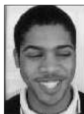
Javar Place WARWICK ACADEMY