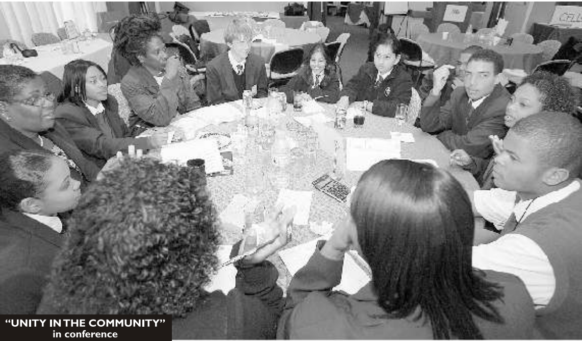
"UNITY IN THE COMMUNITY" in conference

The Youth Conference on March 20th and 21st, was a challenge of mind, wit and skill in many different aspects. The conference was this: A company (created for the purpose of competition, not real) called the BDA Corporation had offered $100,000 towards six different charities. These charities would be created and organised by about 60 students of all different ages and schools. The themes included Environment, Health, Africa, Youth, Education, and Culture.